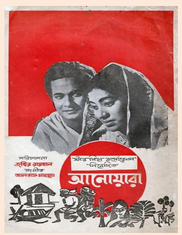
Poster of Anwara

is the curse of Marium who cannot get out of her situation. Sometimes in the film we see a woman from the back and the viewer's inability to see her face establishes the mysterious nature of the persona. It feels as though there is a ghost or an unfulfilled spirit of a woman, who also happens to kill the other women in the life of Marium's lover, her only hope of escaping Sultan's clutches. This depiction is not only unique but quite effective in establishing the need to be free. Kokhono Asheni is never included in the list of films of Zahir Raihan which have strong female representation but to me, as a metaphorical film it has characterised Marium quite powerfully. To me, Marium is the main protagonist of the film. It was also a very contemporary plot with a surreal treatment which was ahead of its time and stands out when compared to mainstream films made at that time in Pakistan and India.