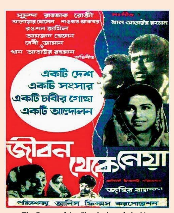
The Poster of the film Jeebon theke Nea

is also very unique, especially at a time when women in films were wives, mothers or incentive for male characters. Outside, the people of East Pakistan (now Bangladesh) rise in political protest, and inside, the family members raise their voices against the tyrannical woman. The two brothers get married and the situation gets more complicated when the sisters-in-law plan to gain control instead, by obtaining the keys of the house. Jeebon Theke Neya has been described as an example of "national cinema", using discrete local traditions to build a representation of the Bangladeshi national identity. It is considered a milestone for Bangladeshi cinema and also a classic.