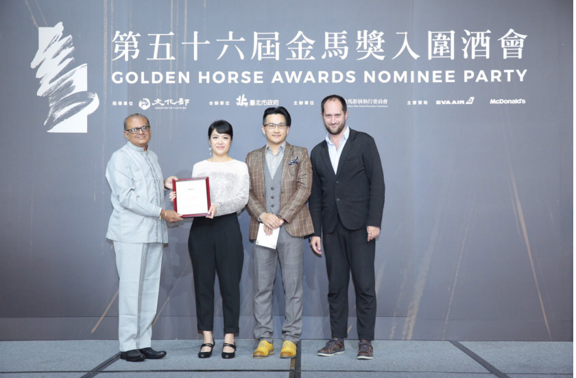
FIPRESCI Award Ceremony